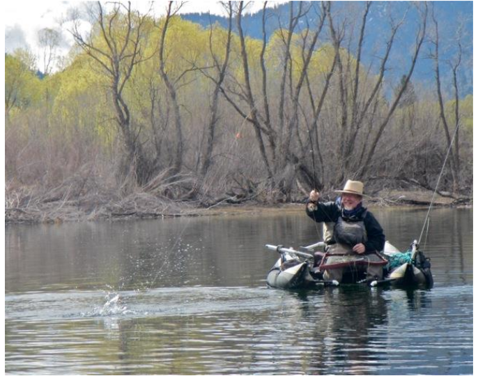
Blue Lake

Wet Fly Hour 5:45 pm Dinner 6:30 pm Brian O'Keefe Program 8:00 pm