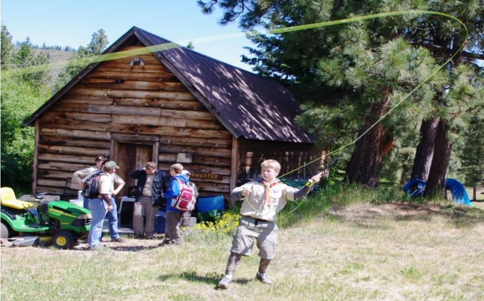
One of the scouts getting into his back cast